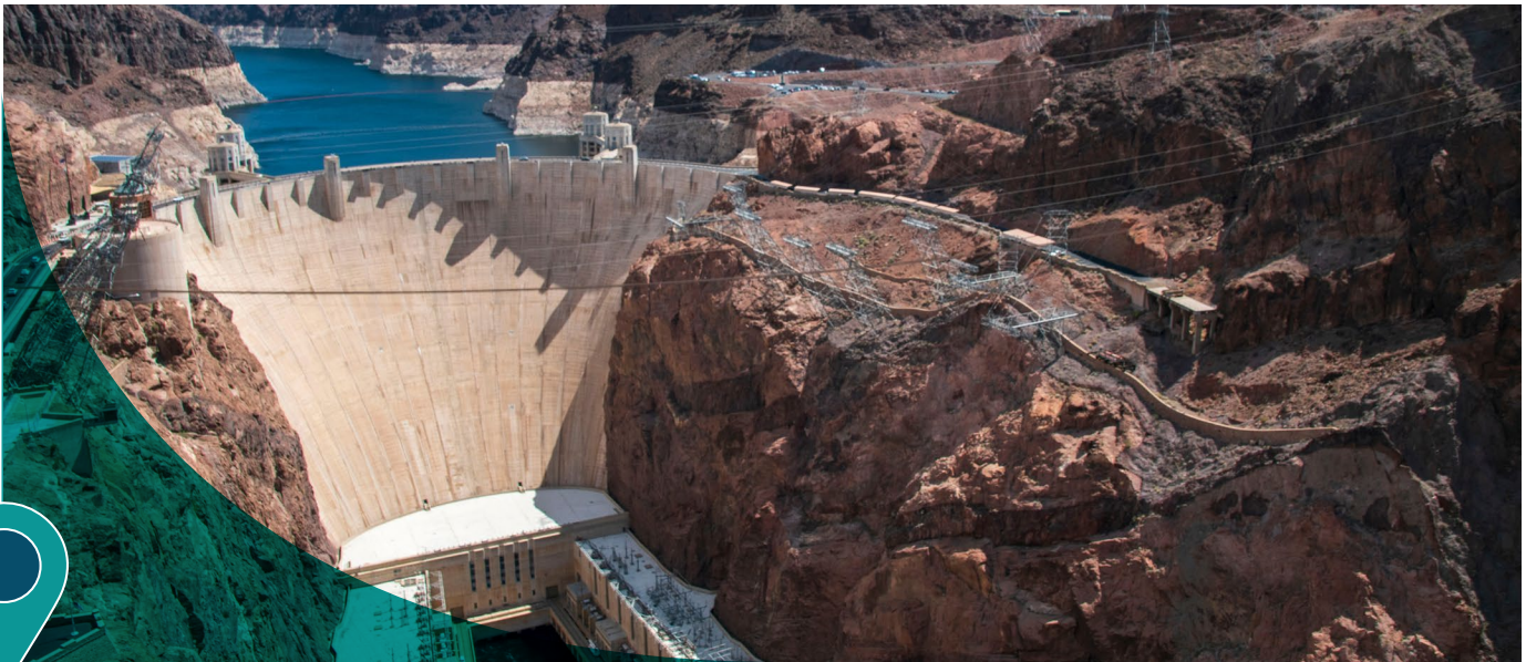
Hoover Dam - Arizona/Nevada