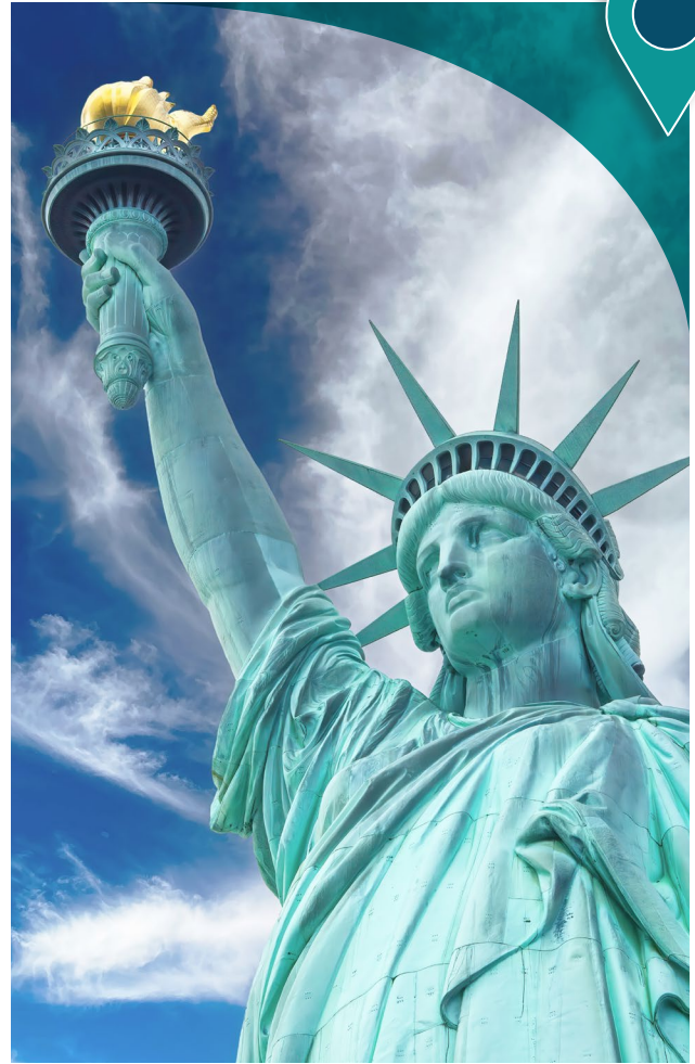
Statue of Liberty, New York

THIS BENEFIT SUMMARY describes the benefit plans available to you as an employee of [insert client name]. The details of these plans are contained in the official plan documents that have been provided to you by your employer, including some insurance contacts. This summary is meant only to cover the highlights of each plan. It does not contain all the details that are included in your summary plan description as described by the Employee Retirement Income Security Act (ERISA).