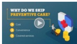
Preventive Care Perspective Style