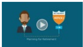
Retirement Planning Bold Lines Style