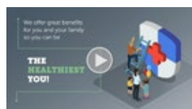
Open Enrollment Perspective Style