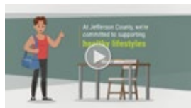
Health and Wellness Business Casual Style