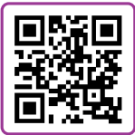
Scan to Download