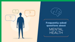
Mental Health FAQs