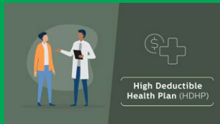
High-Deductible Health Plans