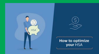
How to Optimize Your Health Savings Account