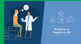
Primary Doc vs Urgent Care vs ER