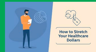
How to Stretch Your Healthcare Dollars