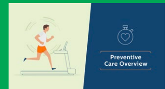
Preventive Care Overview