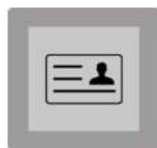
My ID Card